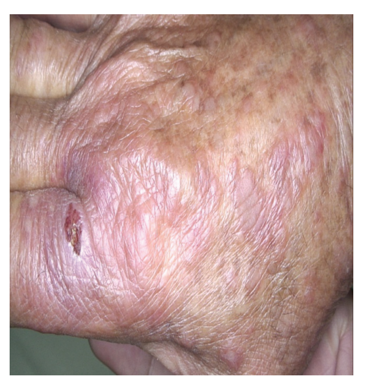
Figure 1. Linear erosion and livid plaque on the second finger