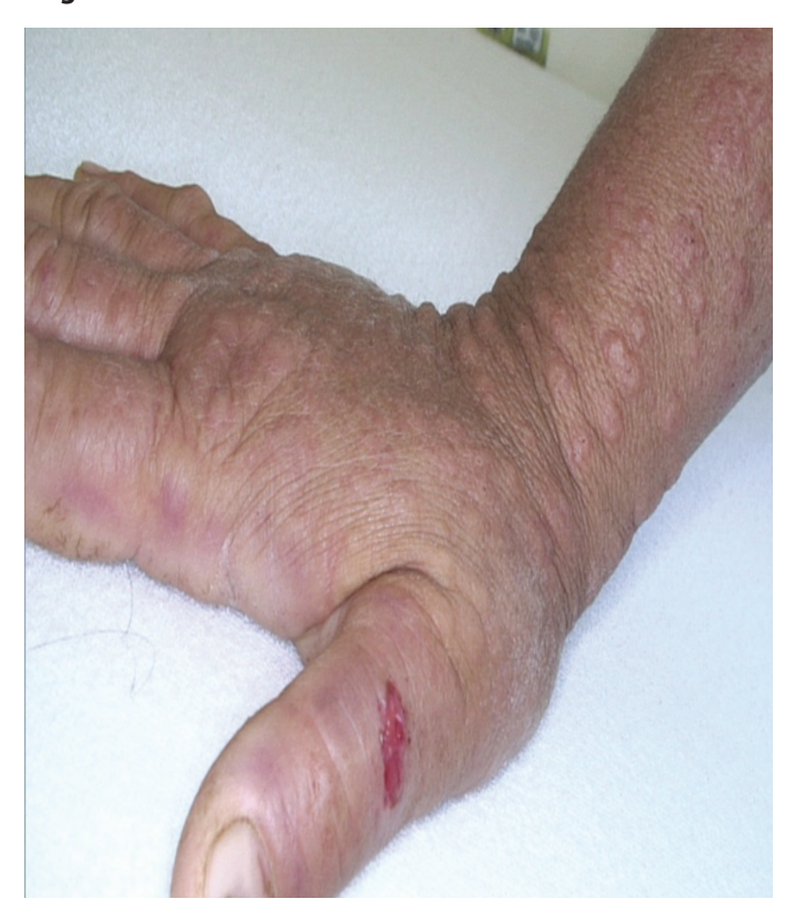
Figure 2. Linear erosion on the thumb

through isolation of the virus. Histopathological examination will reveal cells with vacuoles which contain intracytoplasmic inclusion bodies in the epidermis (2,3). As orf itself was not the cause of presentation to the hospital, our patients did not