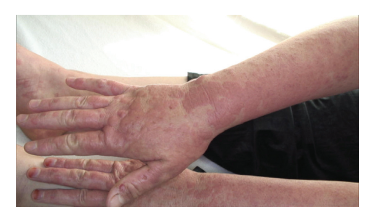
Figure 5. Erosion on the thumb of the right hand and targetoid lesions