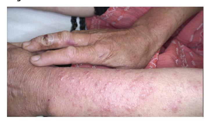
Figure 6. Crusted papular lesion on the third finger of right hand and targetoid lesions on the left arm