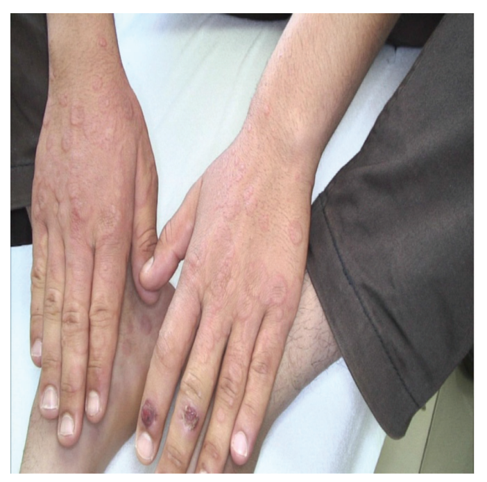
Figure 4. Crusted papular lesion on the left hand second and the third finger

consent to histopathological procedures. Such complications as secondary bacterial infections, lymphadenopathy, lymphangitis, papulopustular eruption and EM may occur in this group of patients. Among patients with EM, 4-13% were diagnosed with orf (6,7). However, the exact rate of EM as a complication of orf is not known (6,8). In our patients, EM occurred in 5-9 days after onset of orf. A common feature of